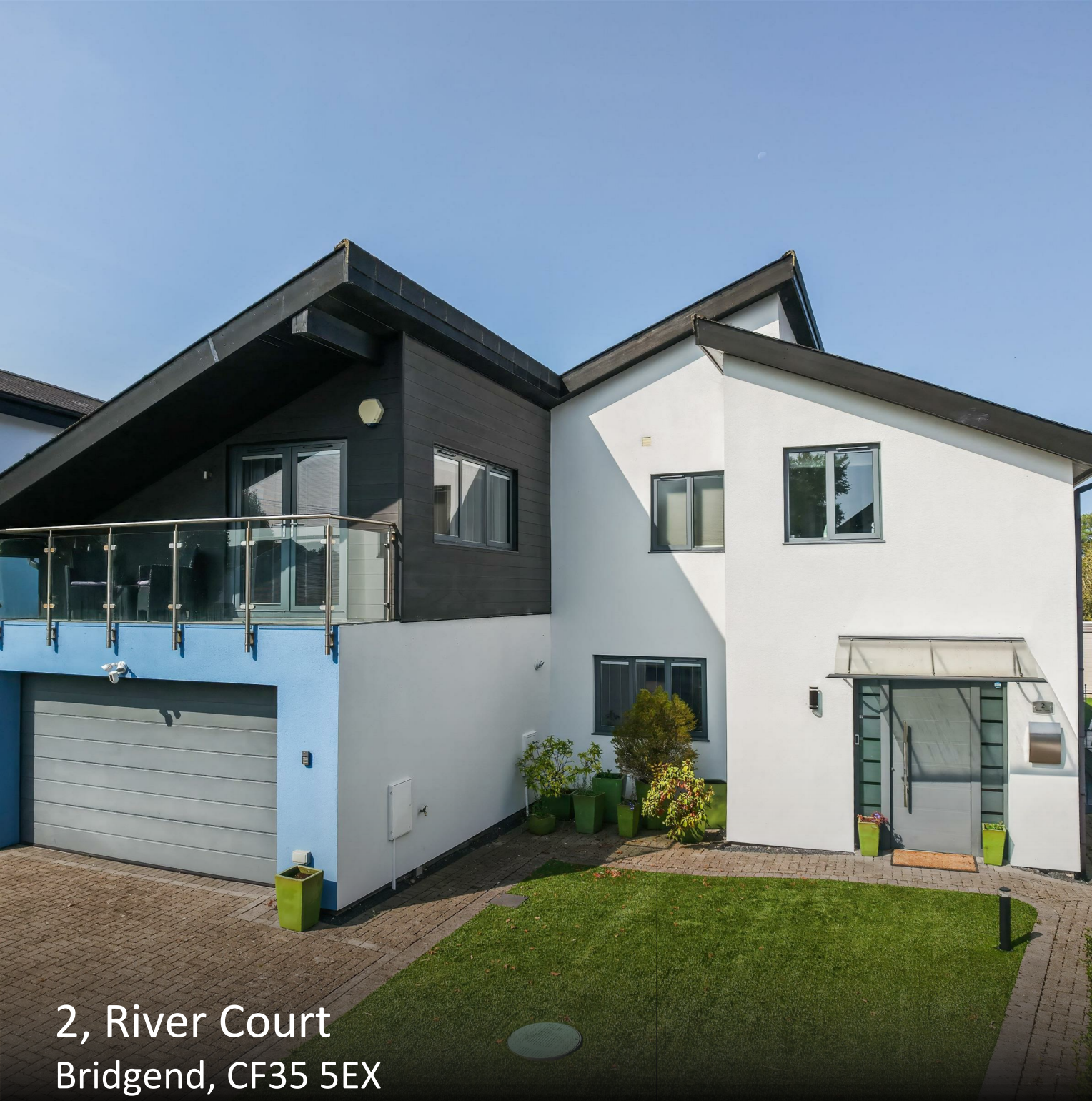
2, River Court Bridgend, CF35 5EX